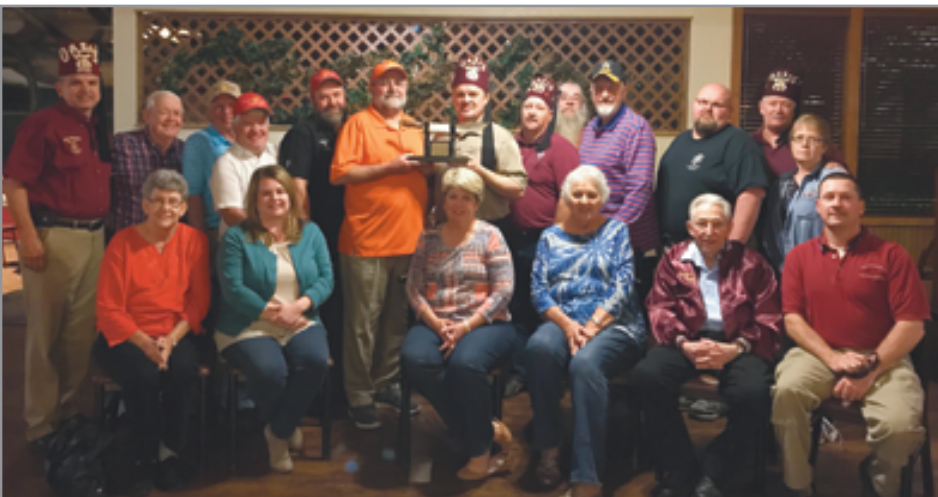
Traveling Gavel reaches Gaston County Shrine Club

Come out to fellowship and try to retrieve the Traveling Scimitar. This is a great way to visit other clubs and meet new Nobles.