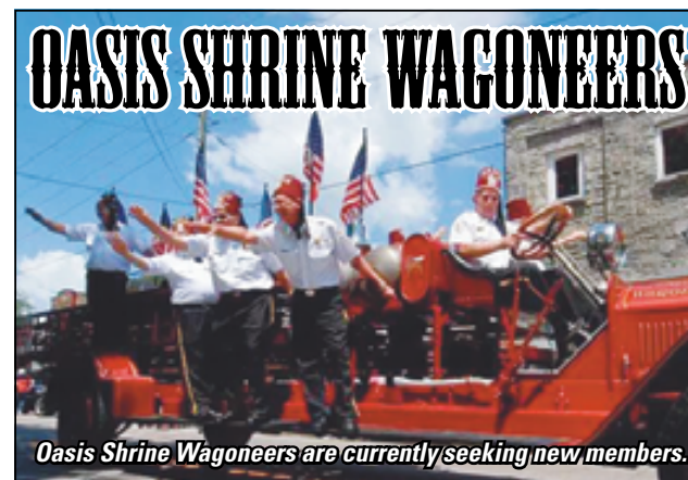
Oasis Shrine Wagoneers are currently seeking new members.

REPRINTED FROM THE PUBLIC RELATIONS VOICE