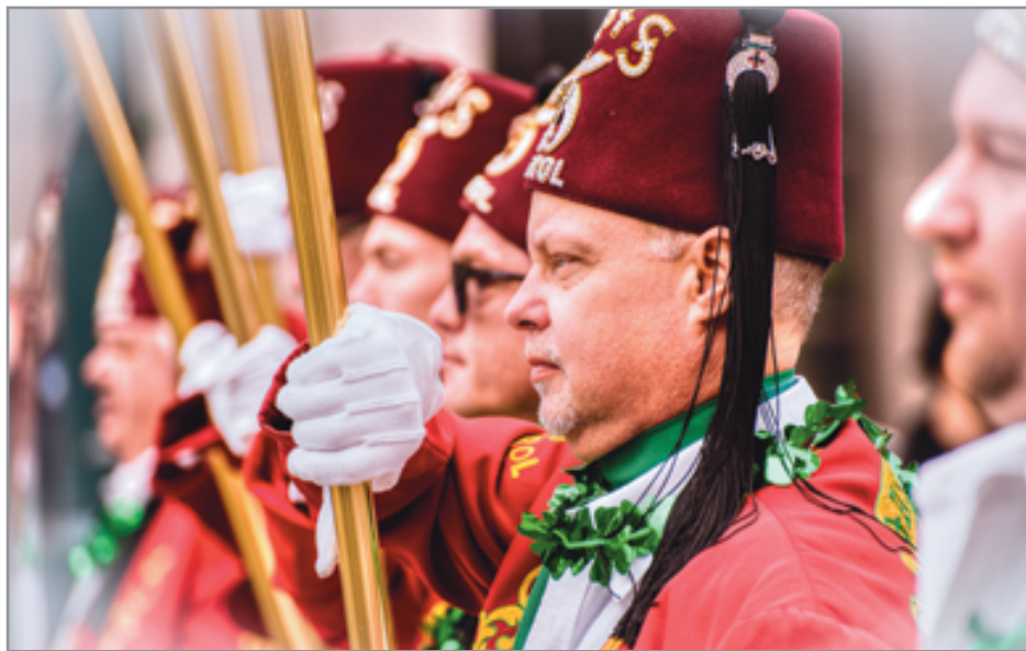
Oasis Patrol steps off at the Charlotte Saint Patrick's Day Parade.