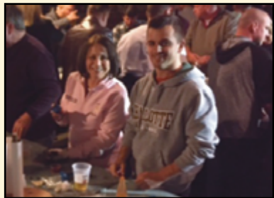
Rowan County Shrine Club Oyster Roast