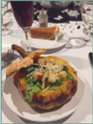
Baby roasted pumpkins hold the salad course.