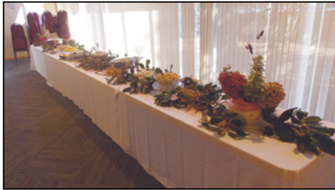
A-One Catering and Events provided an incredible array of food—beautifully presented and delicious!