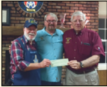
Stanly County Shrine Club Low Country Boil and Check Presentation