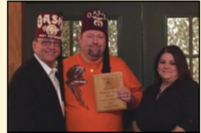
Thermal Belt Shrine Club Installation