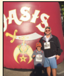
5K run by NASCARTS and Greensboro Shrine Club