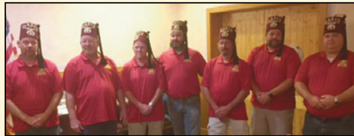
Mystic Shrine Club held its Installation and announced the formation of a new unit - The Paw Patrol!