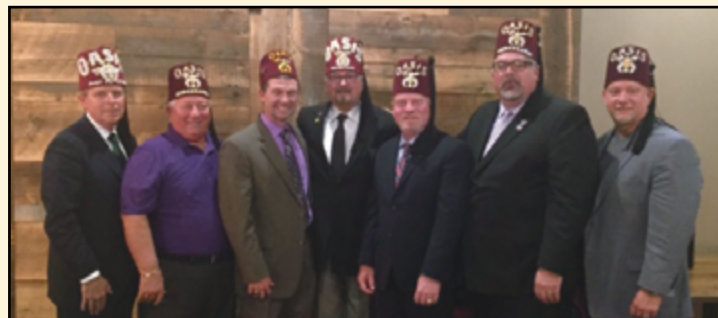
Lake Norman Shrine Club Installation