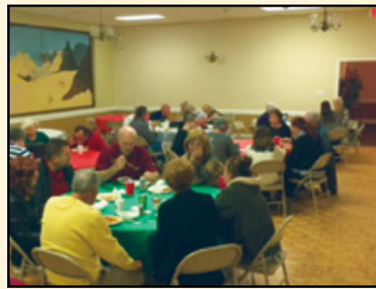
Mecklenburg Shrine Club Member Appreciation