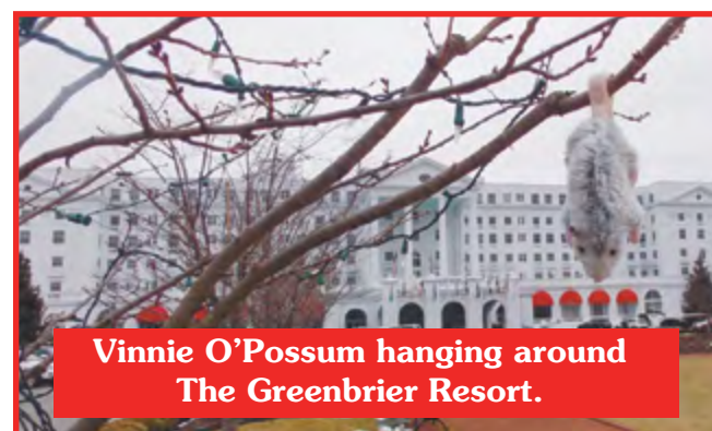
Vinnie O'Possum hanging around The Greenbrier Resort.