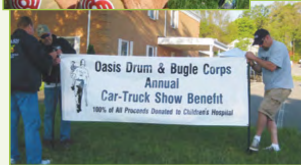
LEFT: D&B members working before the show to put the signs up.