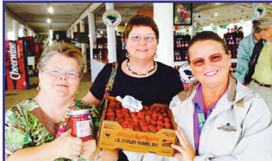
Cooter was caught checking out the strawberries at Strawberry Hill in Chesnee, SC with the "Belvedere Girls".