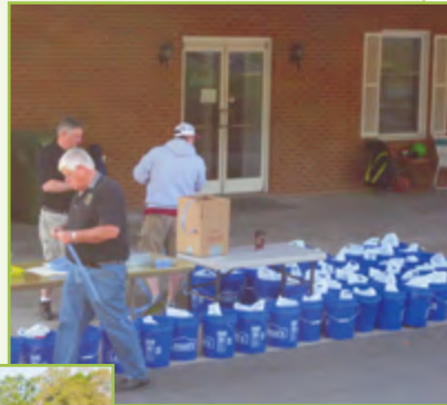
ABOVE: D&B members preparing the goody buckets for the entrants.