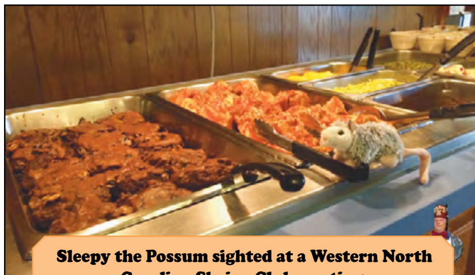
Sleepy the Possum sighted at a Western North Carolina Shrine Club meeting.